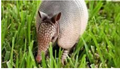
A cute Texas armadillo

As a wildlife rehabber, I am duty bound to tell you about the good things that our armored “dillo” friends do. What most people do not understand is that the armadillo is actually doing them a favor. When an armadillo catches the scent of a grub, a mound of ants or termites, locusts or cicadas, and any number of a variety of earthworms, it quickly digs them up and eats them. The digging aerates the earth and gets rid of these often harmful insects.